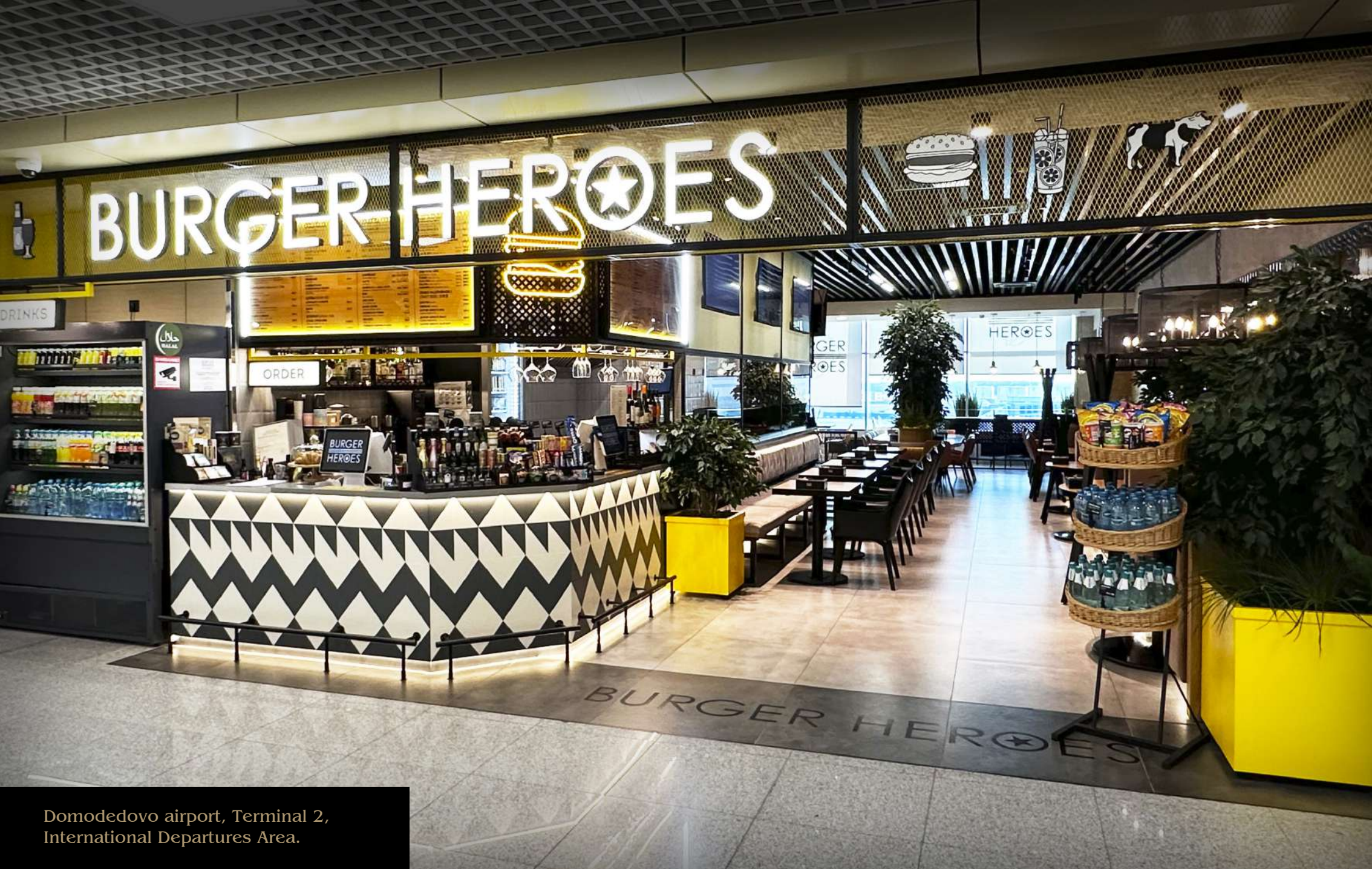
Domodedovo airport, Terminal 2, International Departures Area.