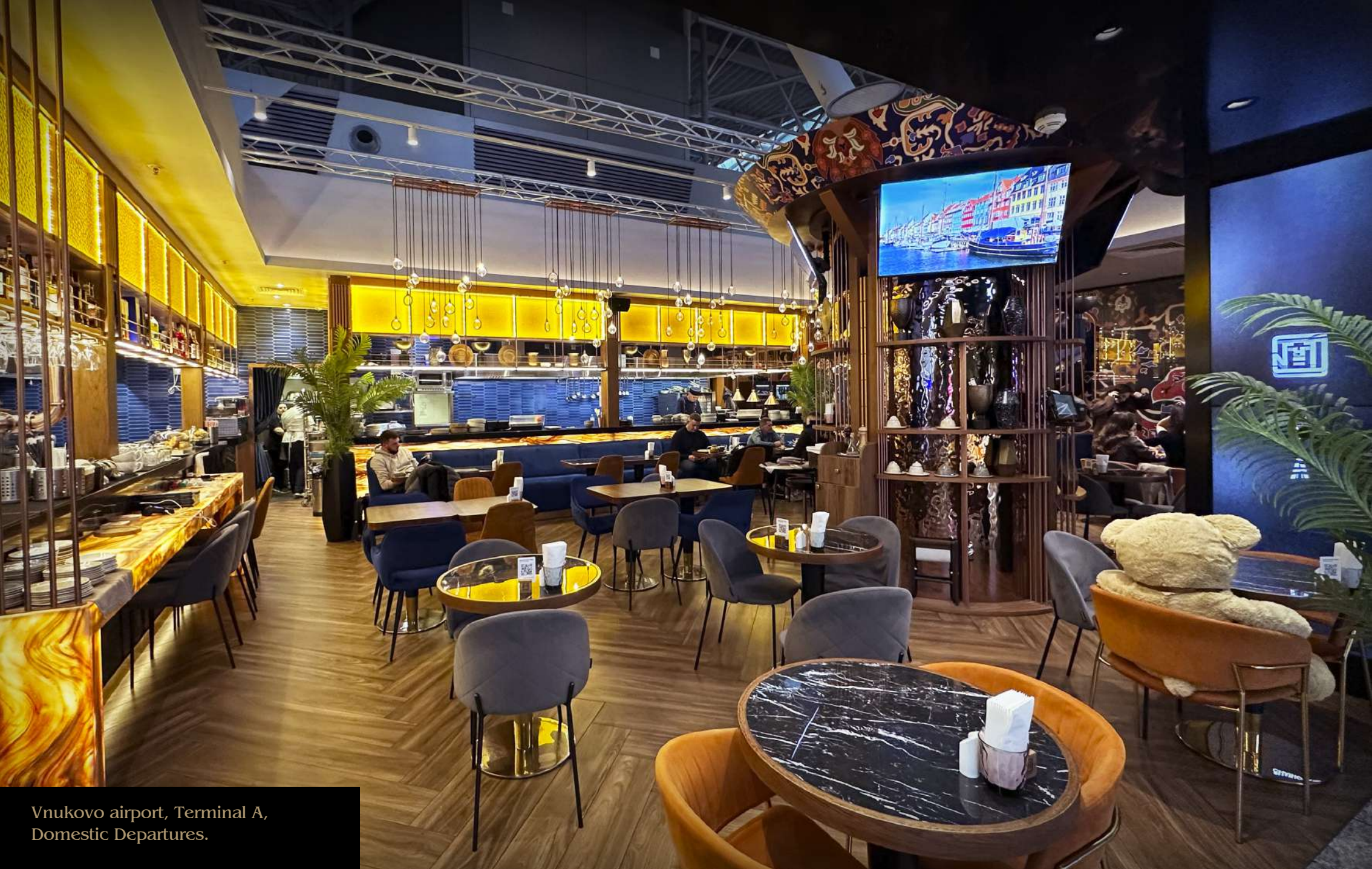
Vnukovo airport, Terminal A, Domestic Departures.