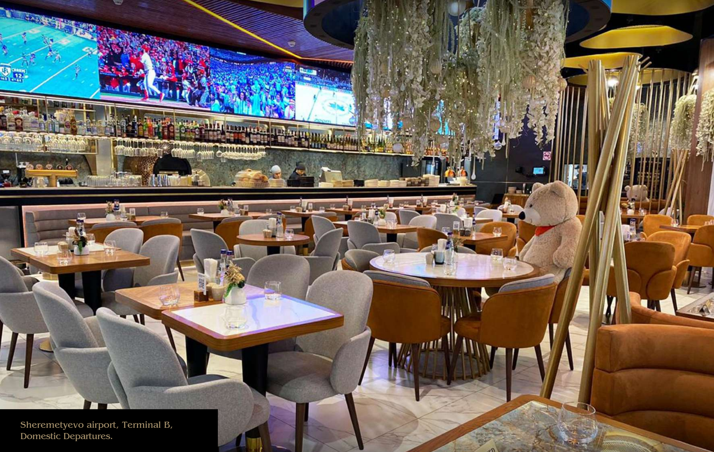
Sheremetyevo airport, Terminal B, Domestic Departures.