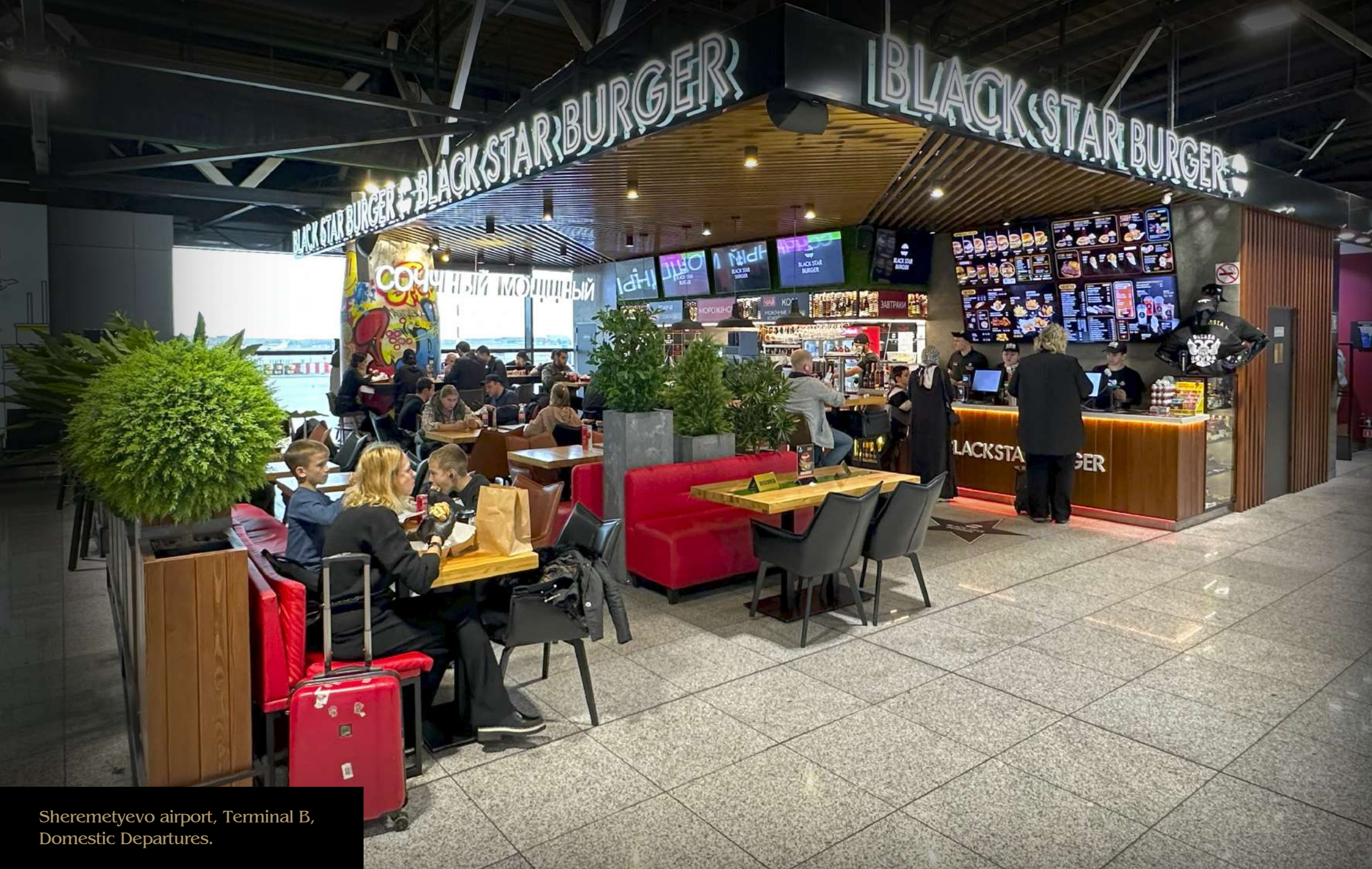
Sheremetyevo airport, Terminal B, Domestic Departures.