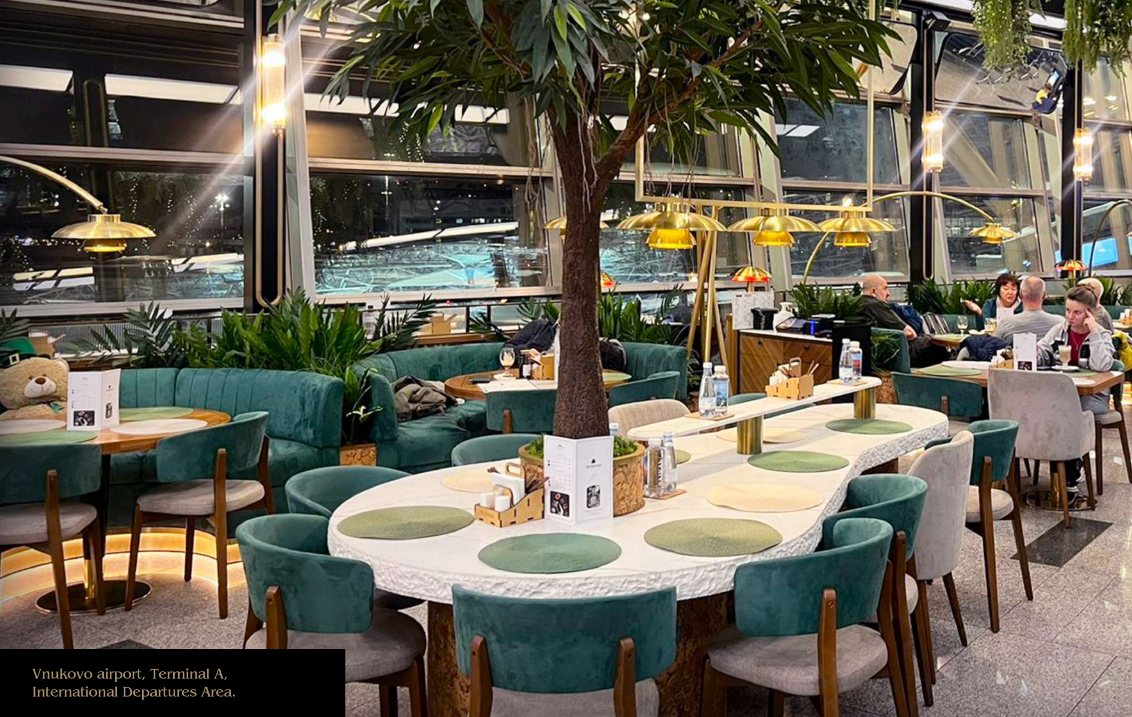
Vnukovo airport, Terminal A, International Departures Area.