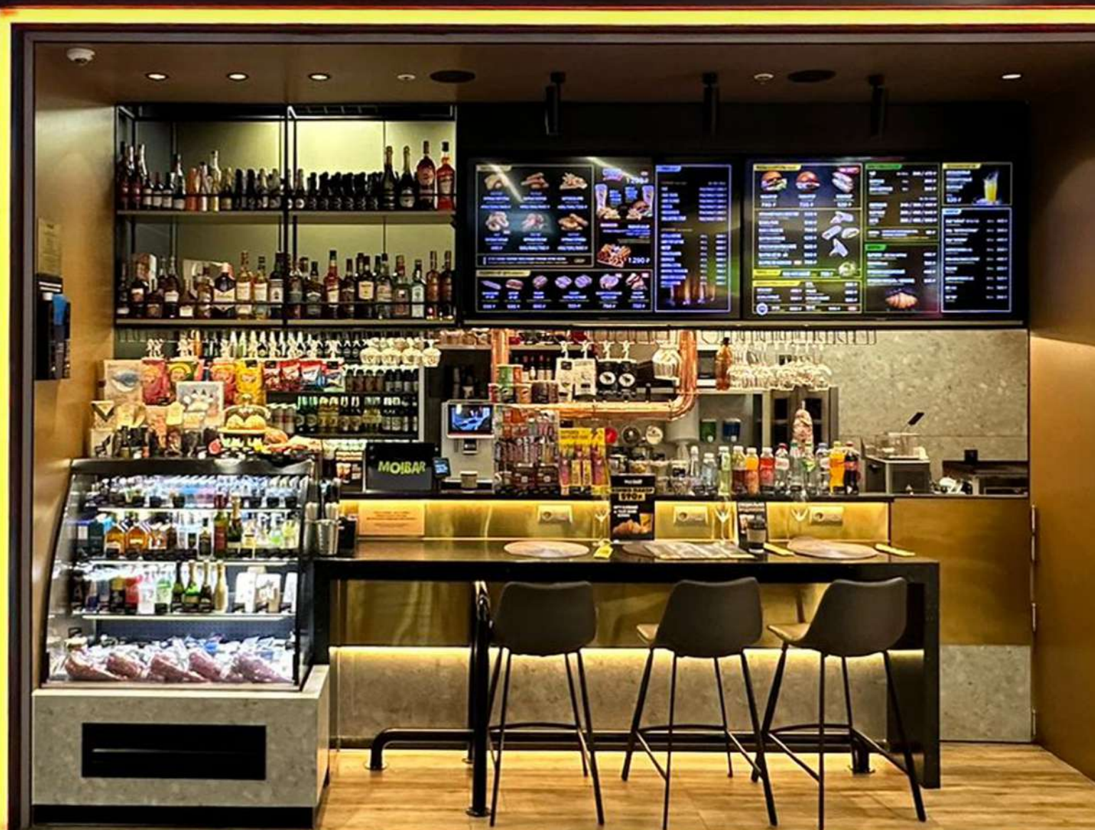
Sheremetyevo airport, Terminal B, Domestic Departures.