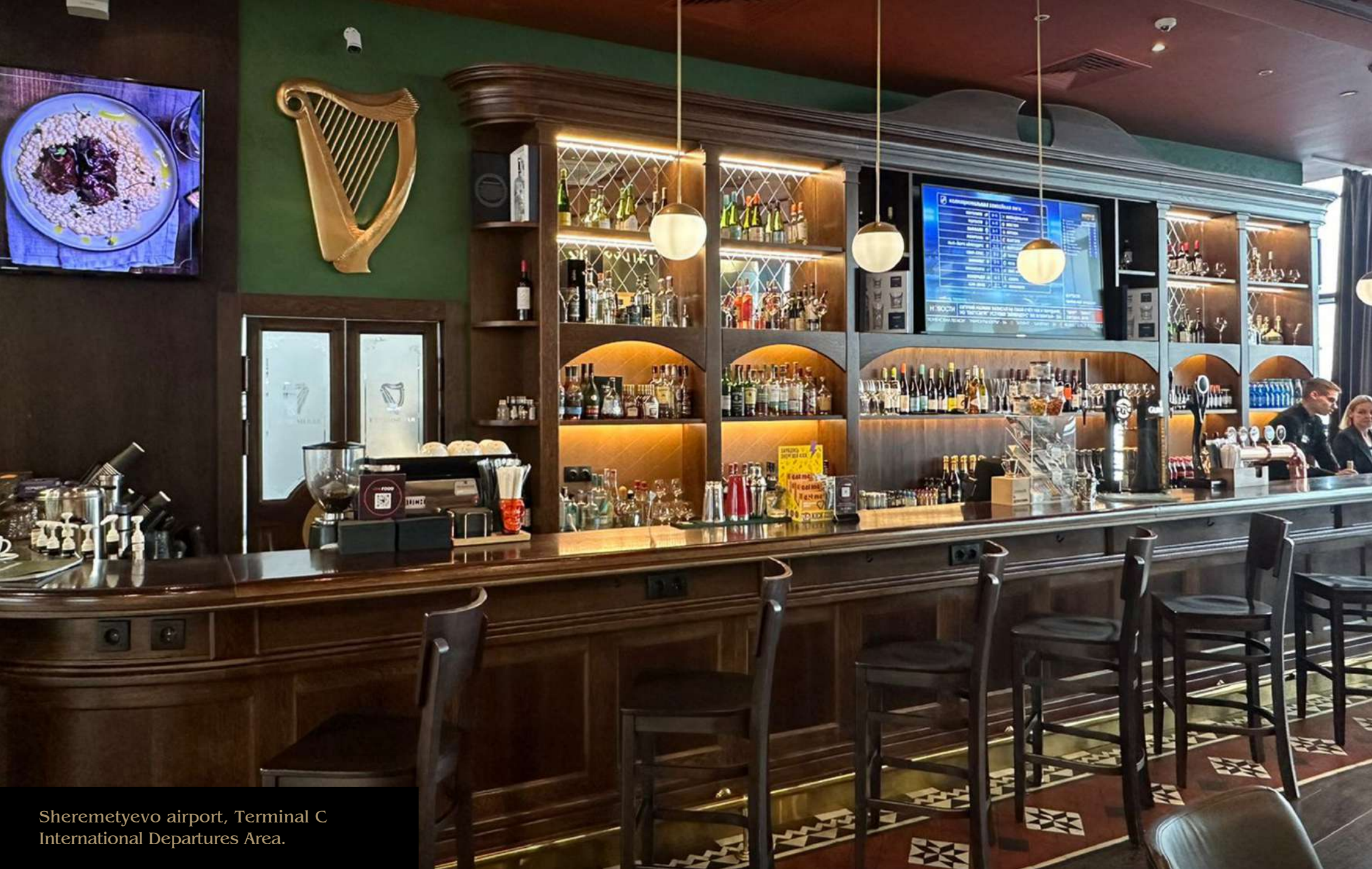
Sheremetyevo airport, Terminal C International Departures Area.