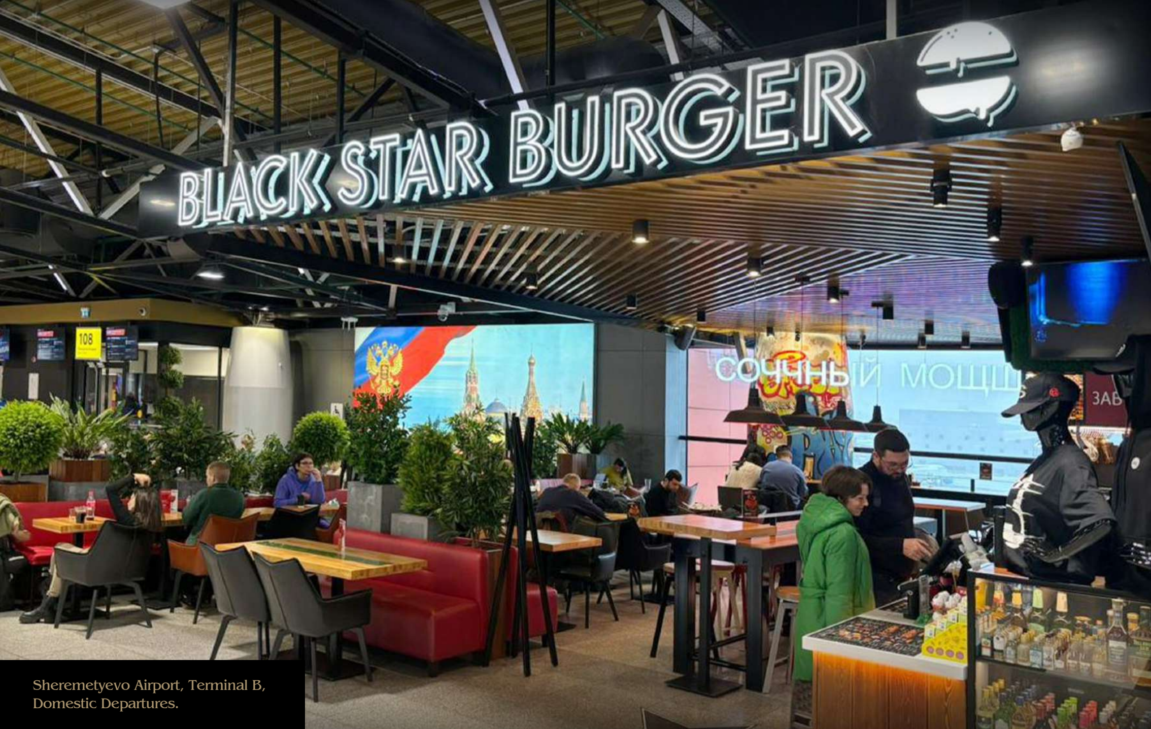
Sheremetyevo Airport, Terminal B, Domestic Departures.