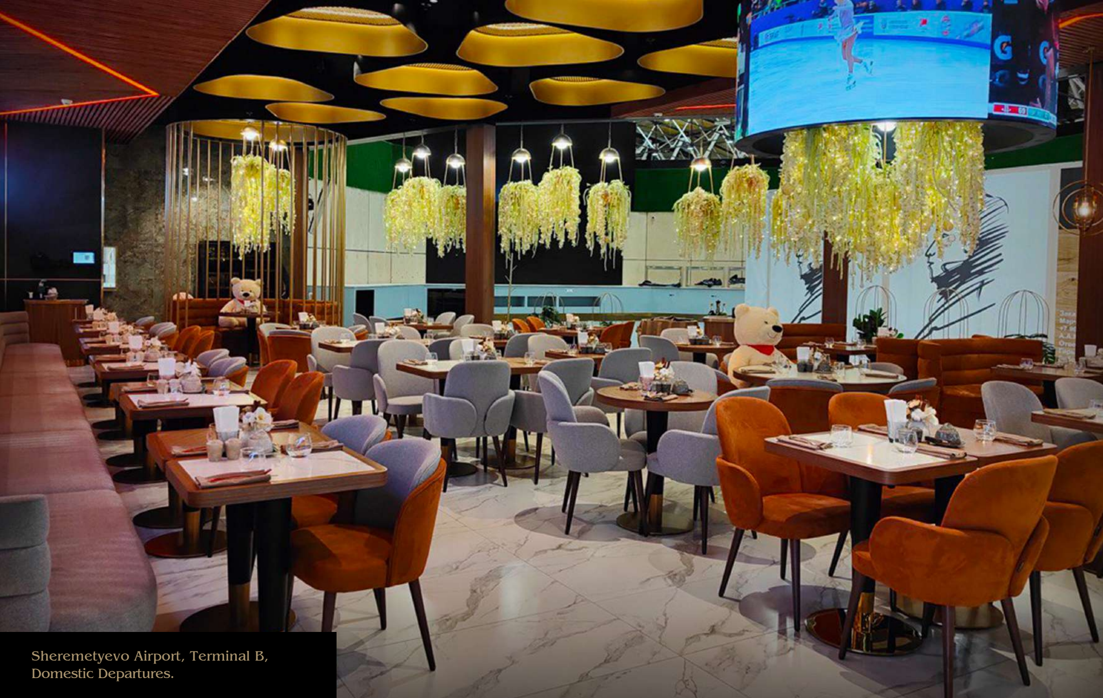
Sheremetyevo Airport, Terminal B, Domestic Departures.