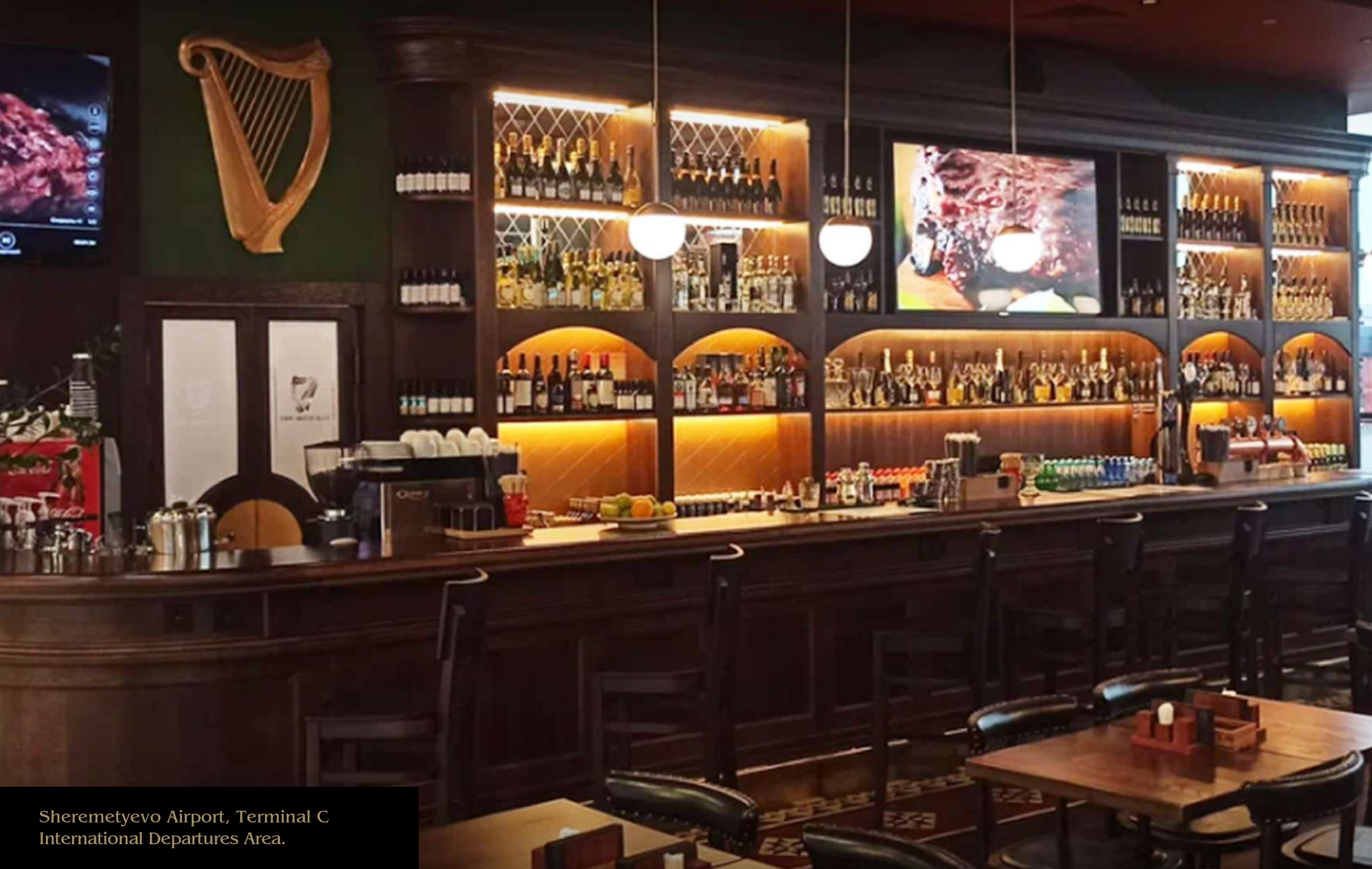
Sheremetyevo Airport, Terminal C International Departures Area.