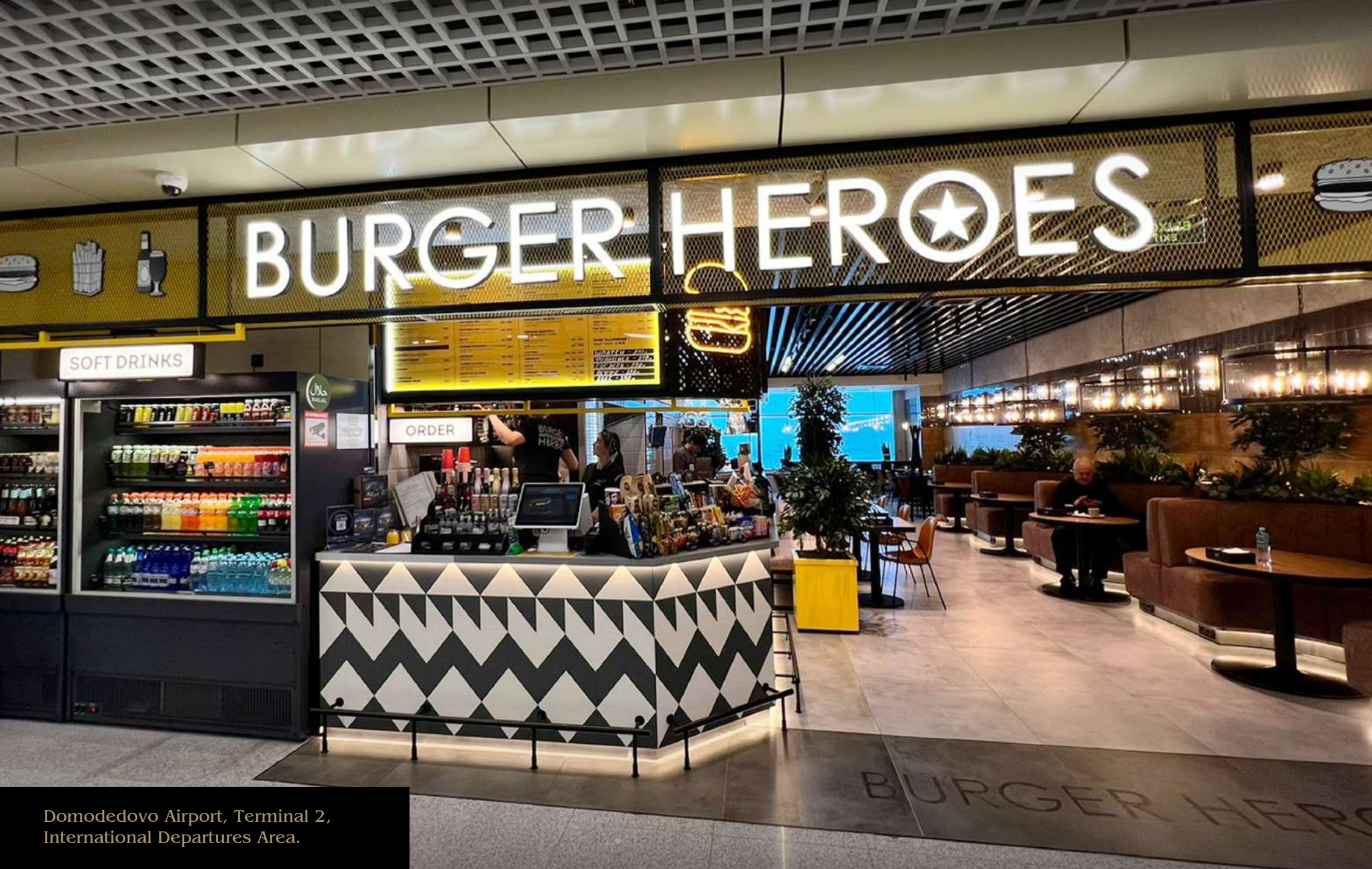
Domodedovo Airport, Terminal 2, International Departures Area.