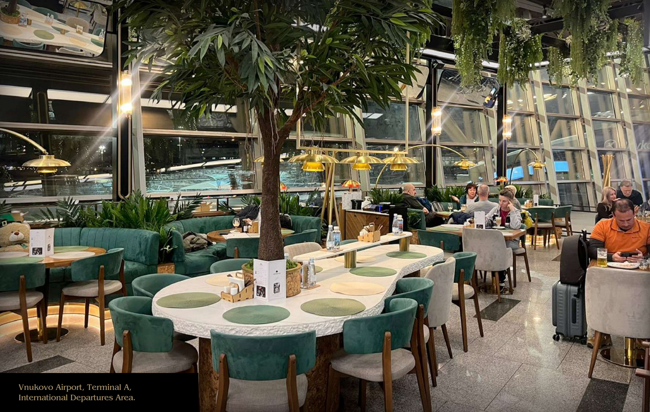
Vnukovo Airport, Terminal A, International Departures Area.