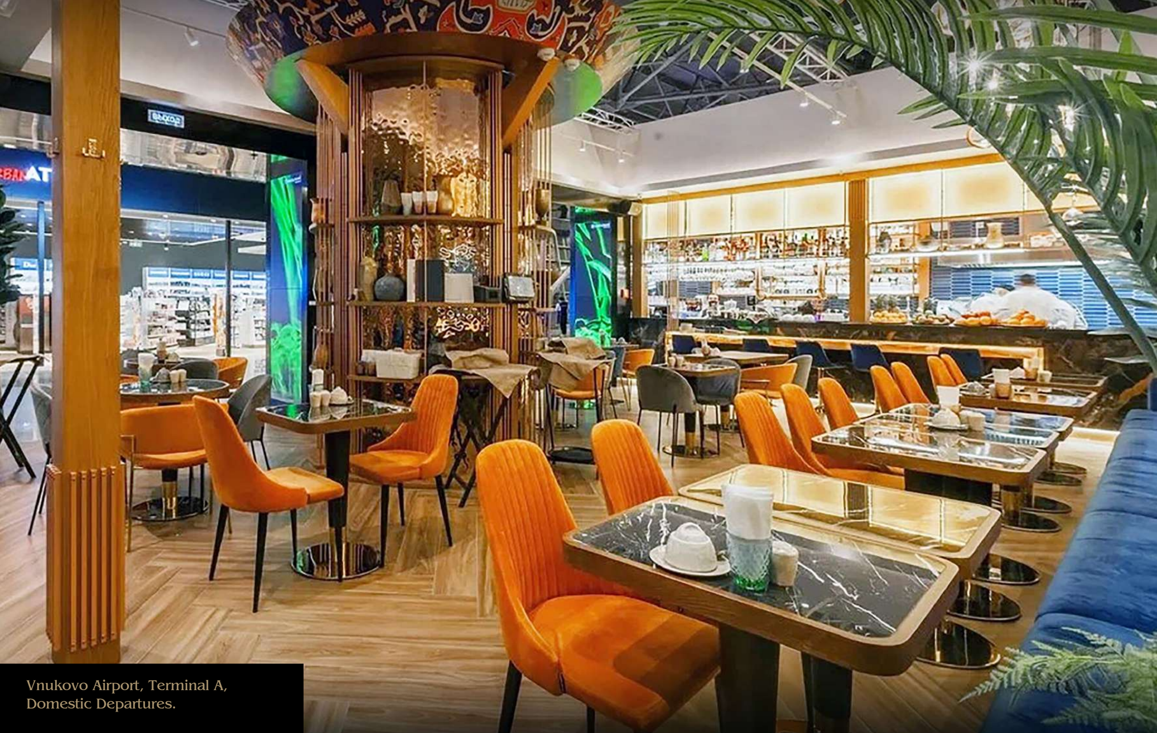
Vnukovo Airport, Terminal A, Domestic Departures.